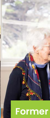
Former Prue wi