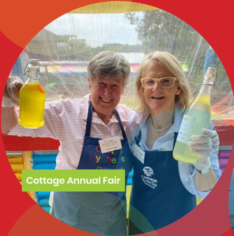
Cottage Annual Fair