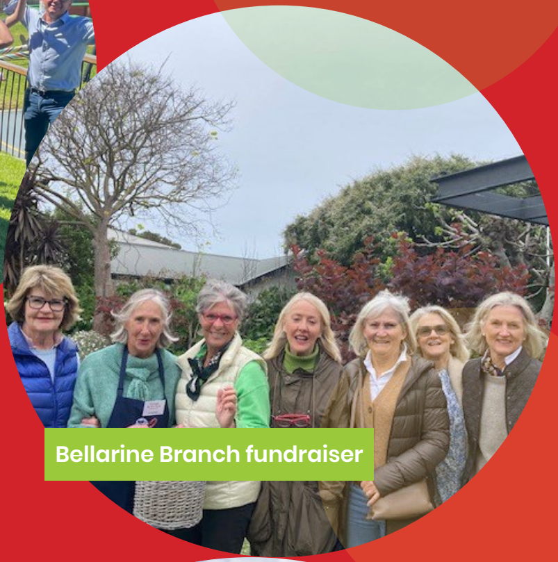
Bellarine Branch fundraiser