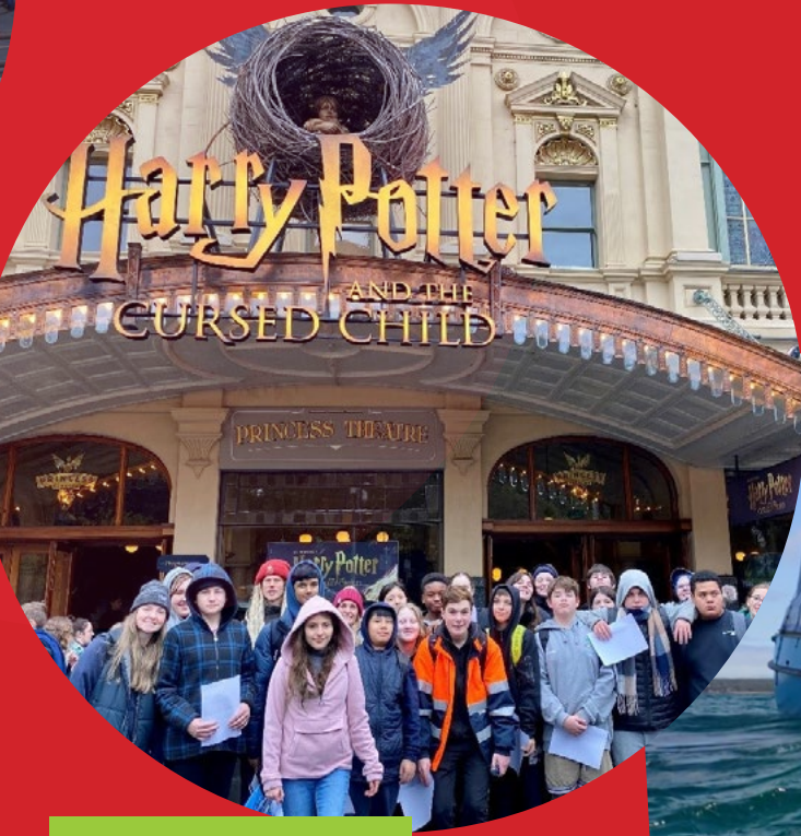
Mentor program - trip to Melbourne