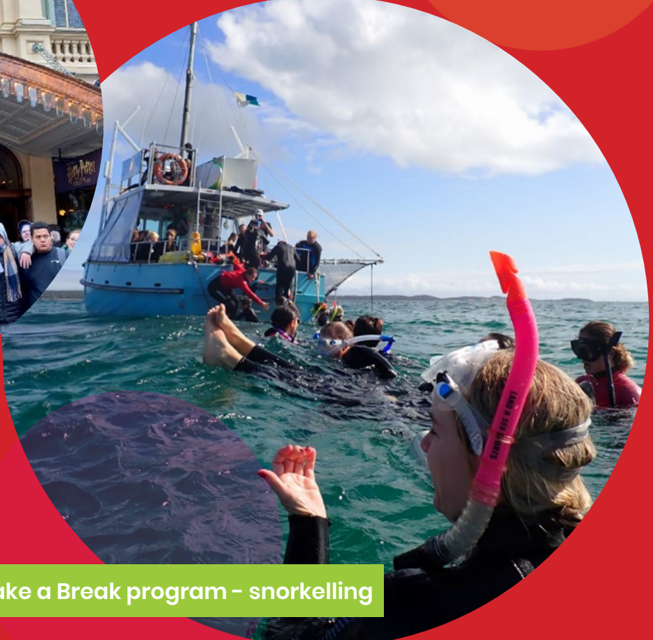
Take a Break program - snorkelling