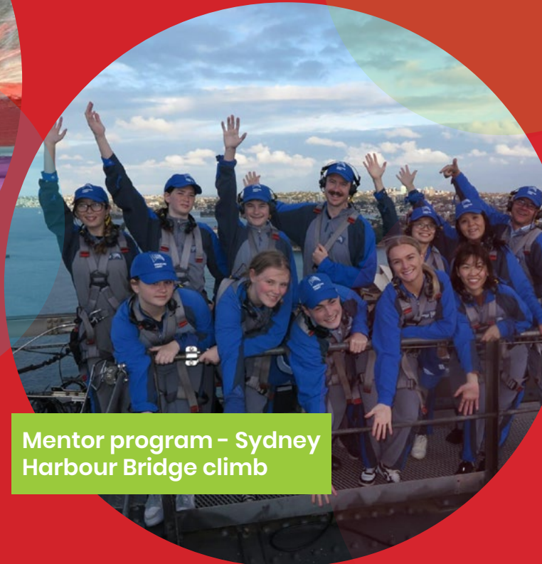
Mentor program - Sydney Harbour Bridge climb