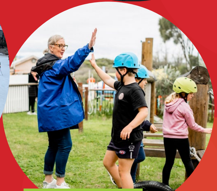
Take a Break program - low ropes course