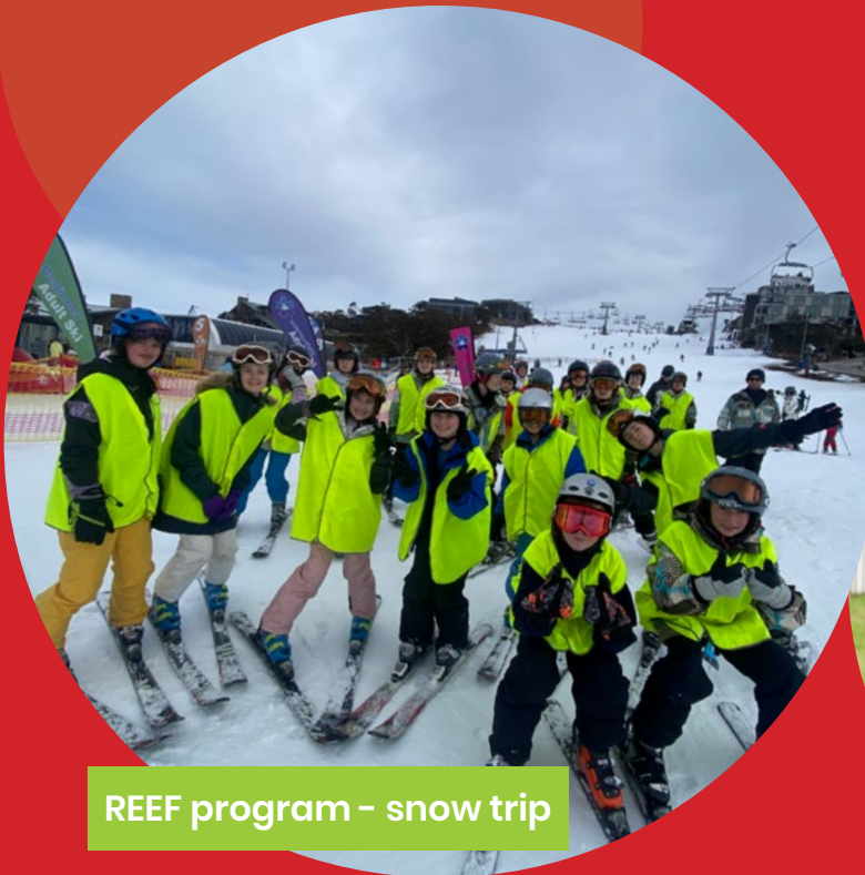
REEF program - snow trip